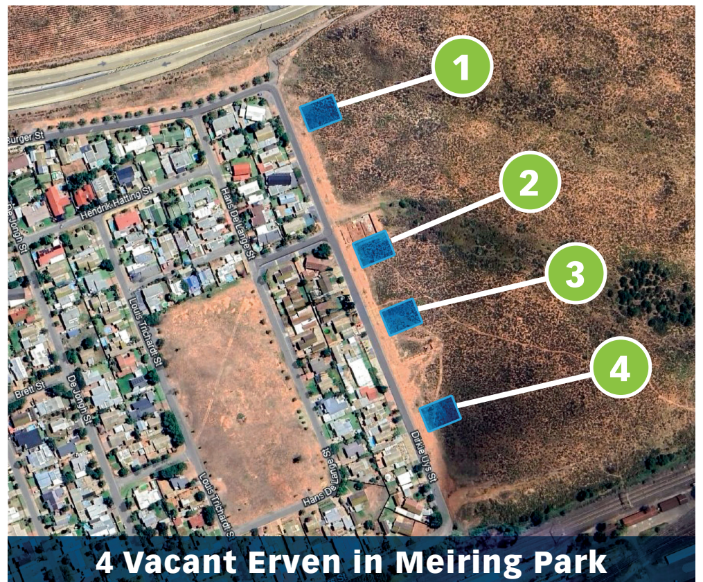
4 Vacant Erven in Meiring Park