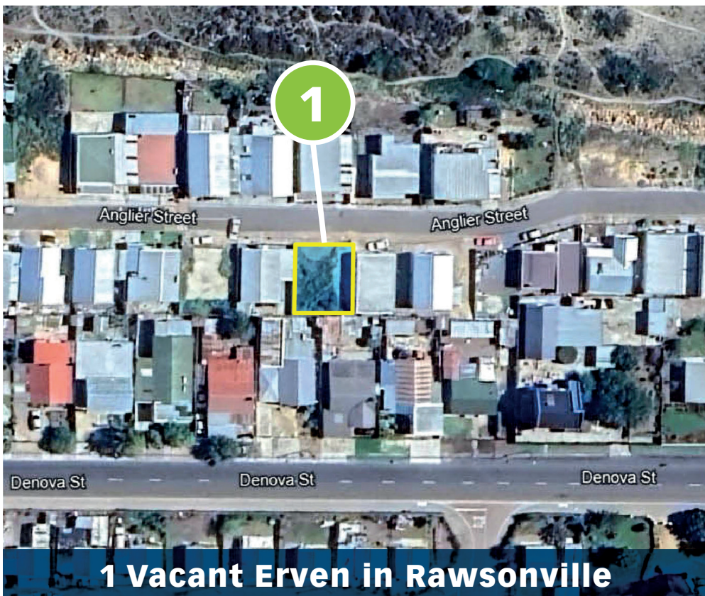
1 Vacant Erven in Rawsonville

MUNICIPALITY • MUNISIPALITEIT • UMASIPALA